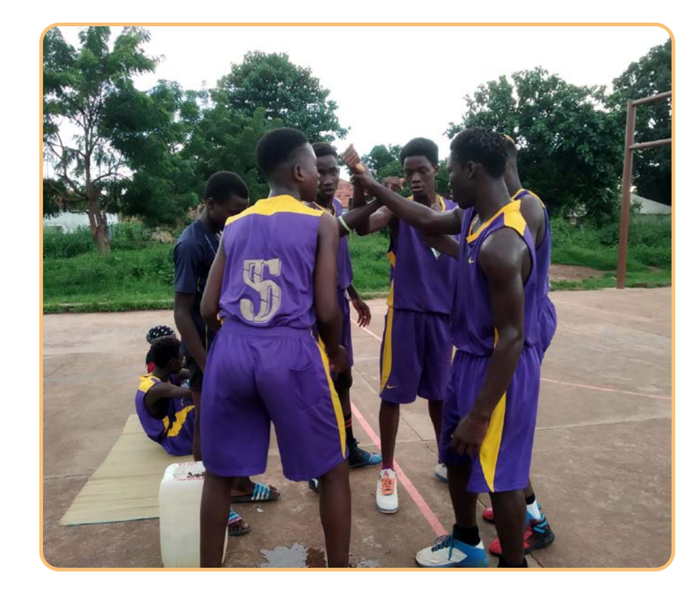
July 2019; organisation of a 3 day basketball Festival in Bissorã, including teams from the capital city of Bissau, Bula, and Mansoa.